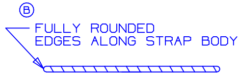
SECTION A - A SCALE: 6x